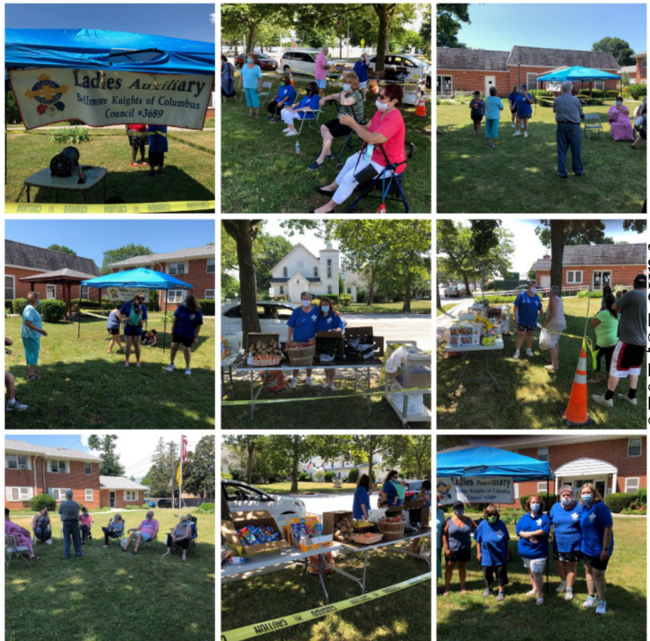
Dance Along at the Bellmore Senior Center June 28, 2020