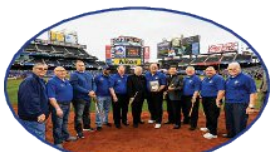
NYS Knights of Columbus receiving the Spirit Award 2019 NYS will also be presenting the Colors

Join us at Citifield* on FRIDAY, MAY 28, 2021 AT 7:10 PM to watch the RIVALRY HEAT UP between the Braves & Mets